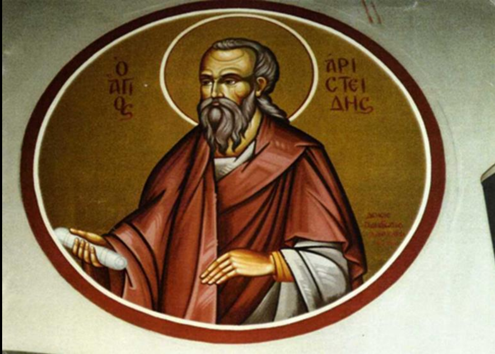
Aristedes of Athens