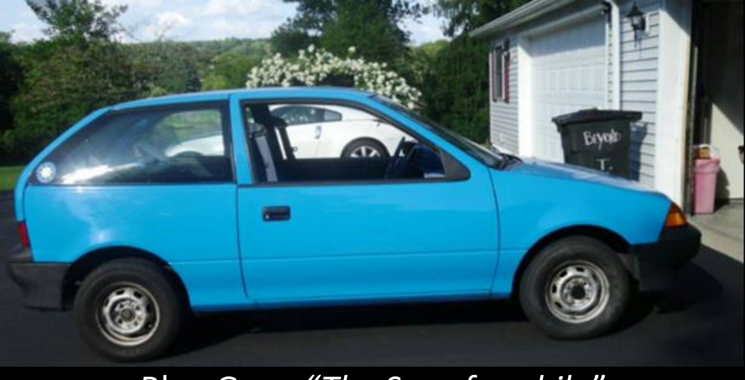
Blue Geo "The Smurf-mobile"